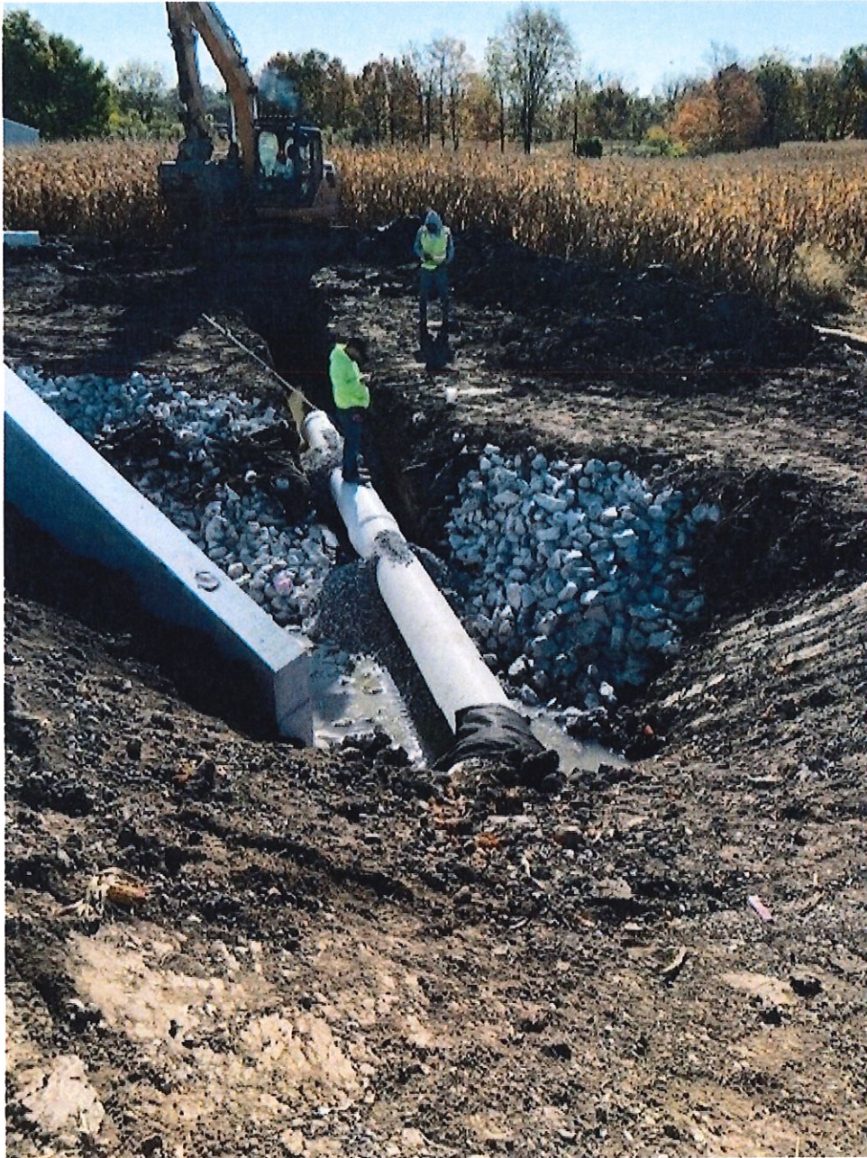
William Baker Tile – South Side of 236 th – reconnection of Tile