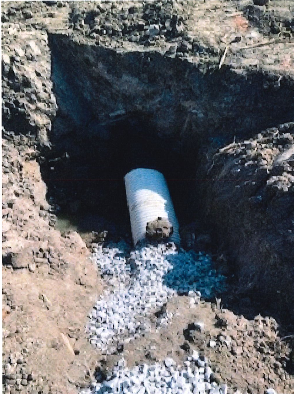
William Baker Tile – South Side of 236 th – reconnection of Tile