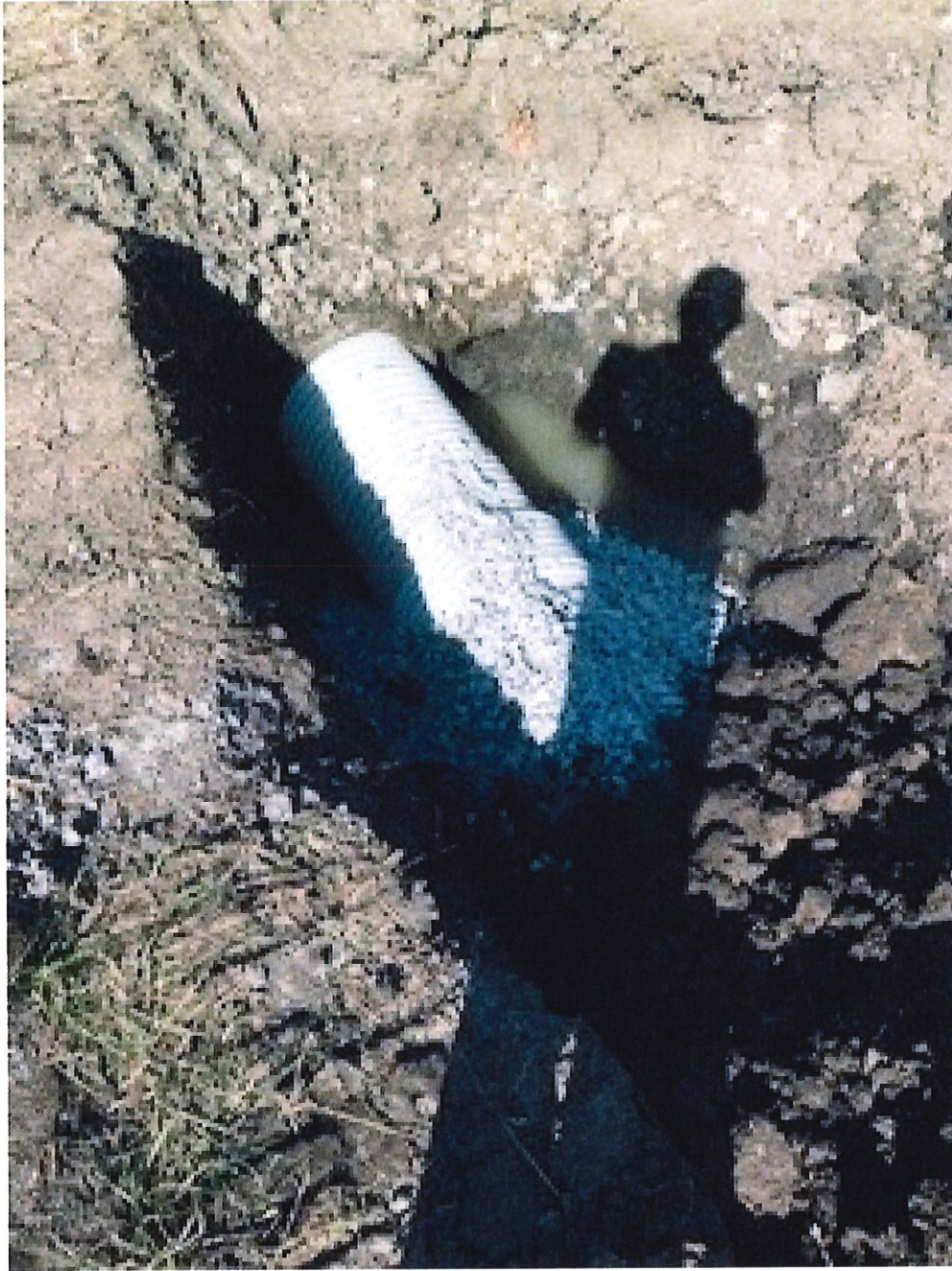
William Baker Tile – North Side of 236 th – reconnection of Tile