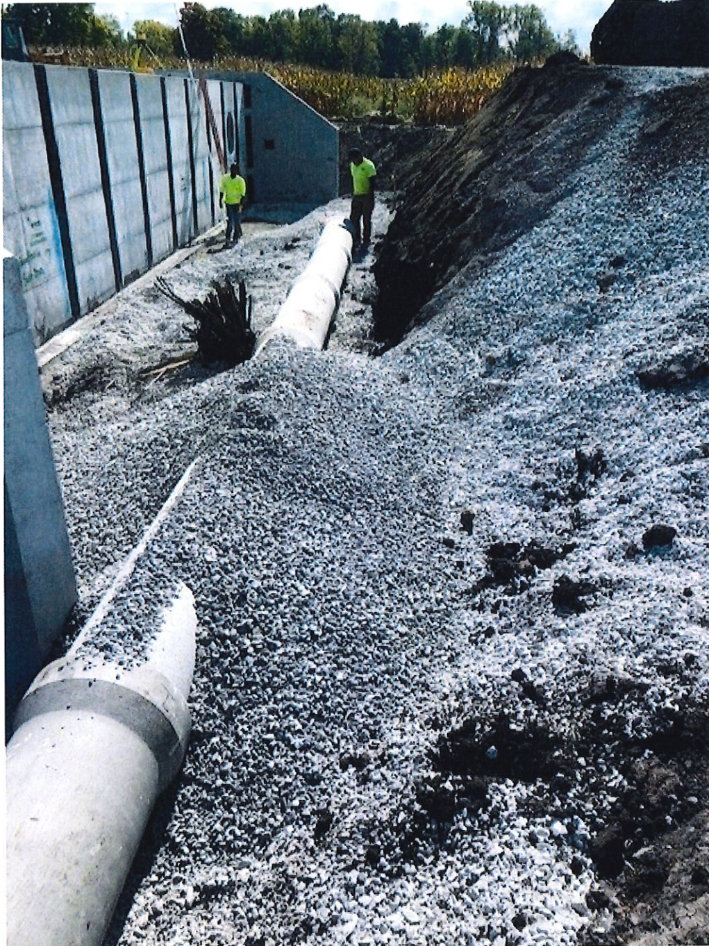
William Baker Tile — replacement of Tile on West Side of Str 57 under 236th